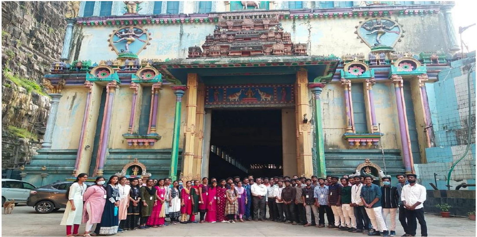
One Day Industrial Visit to SRISAILAM RIGHT BANK POWER HOUSE (SRBPH), APGENCO on 5th November 2022